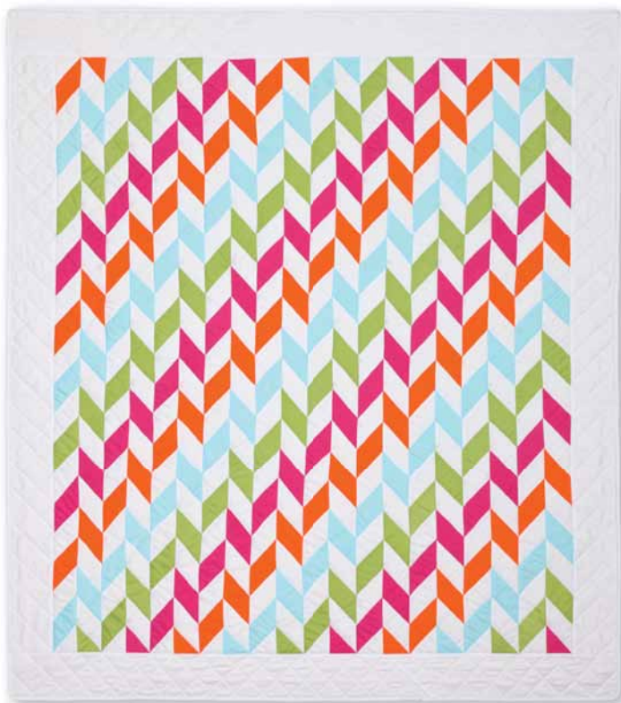
Fabric provided by Robert Kaufman Fabrics, Kona Dimensions